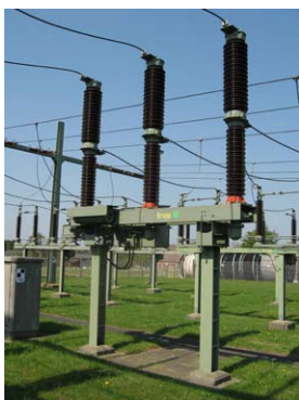
Foto of the power switch

This technique produces large amounts of data and the handling and administration of this within the CAD environment was made easy by PointCloud. In addition, by overlaying the point clouds on the transformer station parts as they were modelled, a real-time quality check could be carried out. The result of the exercise is a detailed 'as-built 3D model' containing every component part of the transformer station from which 2D plans can be extracted at any point. In addition, any planned renewals and reconstructions can be added to the model so that their effects can be simulated.